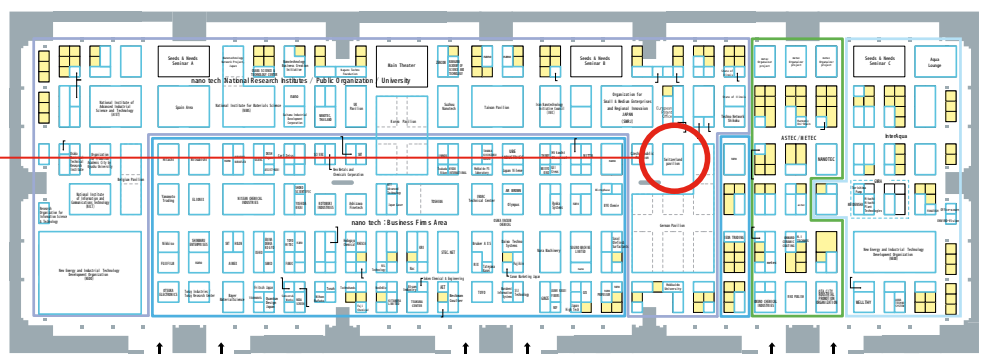
Floor plan nano tech 2012 as per September 2011