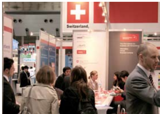
Swiss Pavilion nano tech 2011

October 31, 2011 First come, first serve basis; space is limited