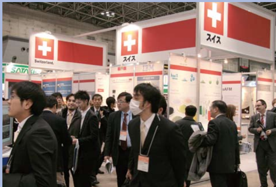
Swiss Pavilion @ nano tech 2011

We support Individual solutions, please get in contact with the organizer.